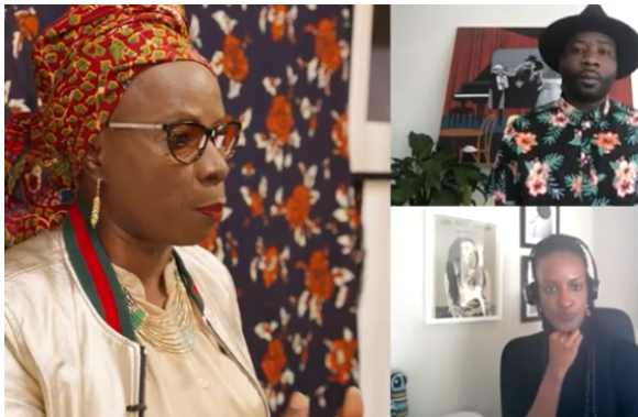
Conversation #1 (May 2021)