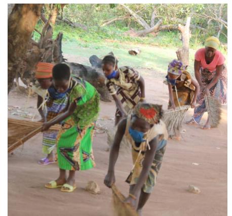
Mentor with her club cleaning up community during sanitation project.

public health and to better fight against unsanitary and dangerous methods of waste disposal in public spaces which is a consistent problem mentors observe. Mentors reported that they were inspired to do something for their communities by the new civic education content which emphasizes the importance of finding and filling needs in your community..