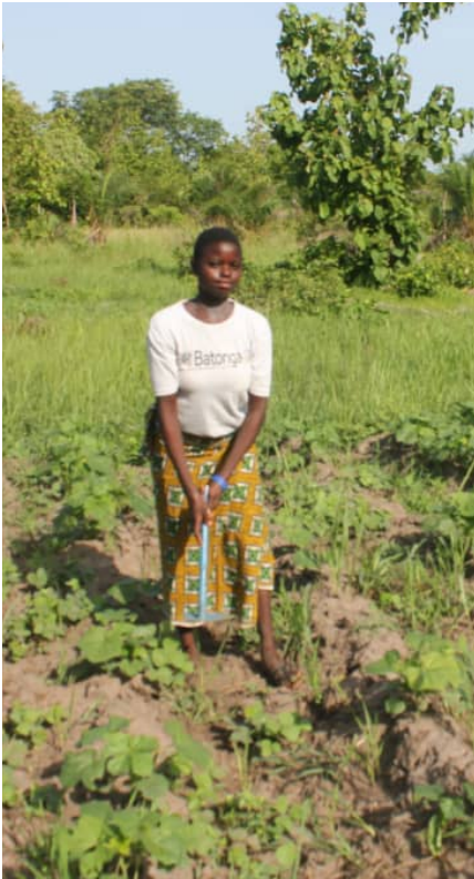
YWBC member watering Okra garden

Batonga’s Young Women Business Circles (YWBCs) launched in Q4 2020 to give young women 18–30 in Batonga’s implementation communities a safe, women-only space to build their professional and financial skills and each received modest business seed funding in January of 2021. Since then YWBC businesses have been thriving under the management of Circle members, generating over $13,000 in sales and over $1,000 in profits since April!