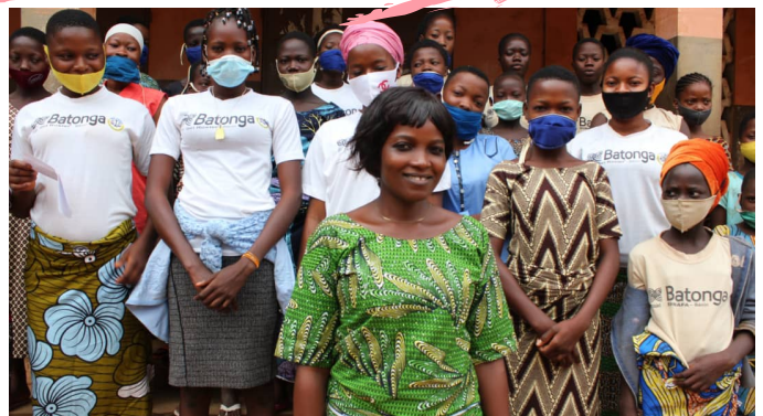
Exemplary Women Speakers standing with Leadership Clubs (May 2021)