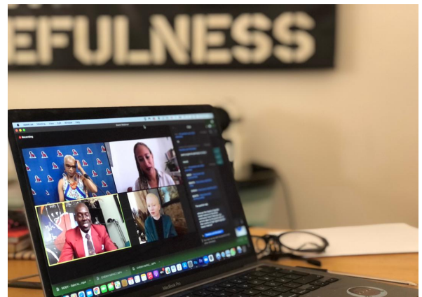
Conversation #2 (June 2021)