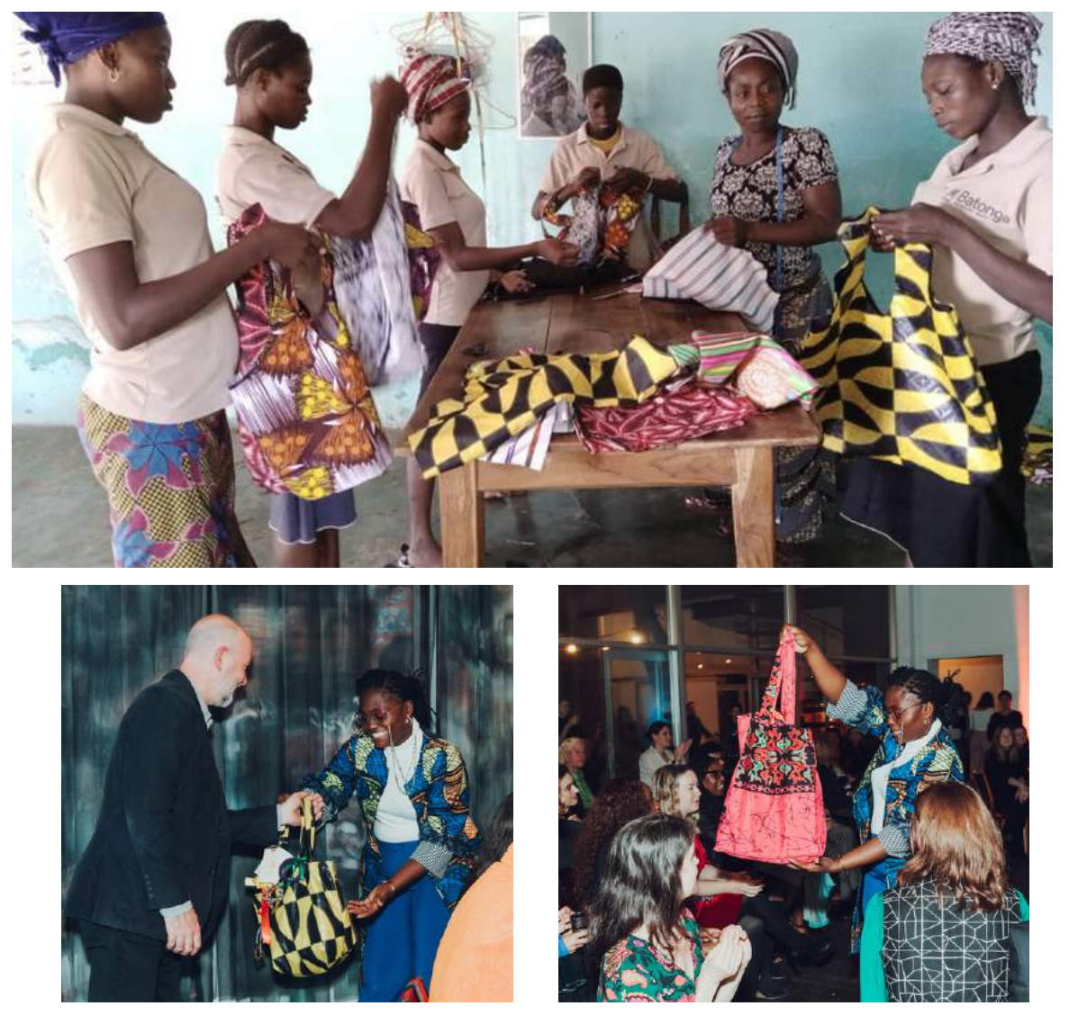
Handmade items and products were on display and auctioned at the November Fundraising Event in New York City

These were moments of great visibility for the products of the Business Circles, allowing access to new markets with diverse preferences, standards, and demands.