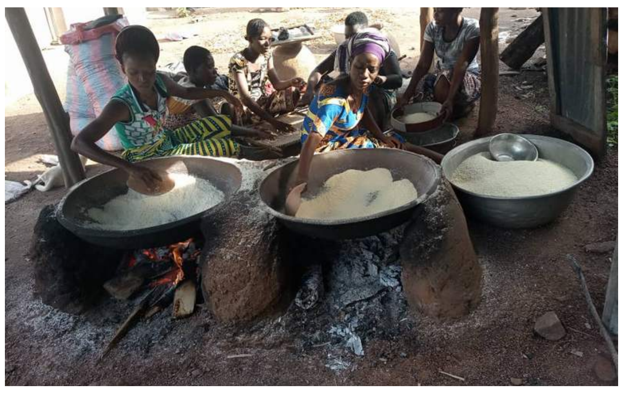
Making cassava flour after the peeling process and others