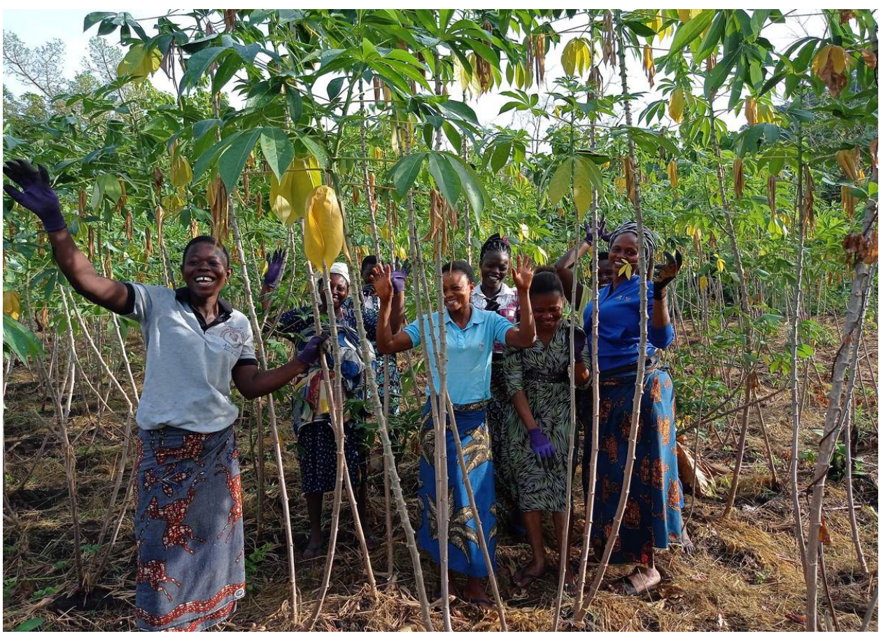
Young women from the Circle that grows cassava and sells it to another Circle

This cooperation not only diversifies supply chains but also increases the ability to obtain quality, locally made products at market price and ultimately enhance the overall sustainability of the Business Circles.