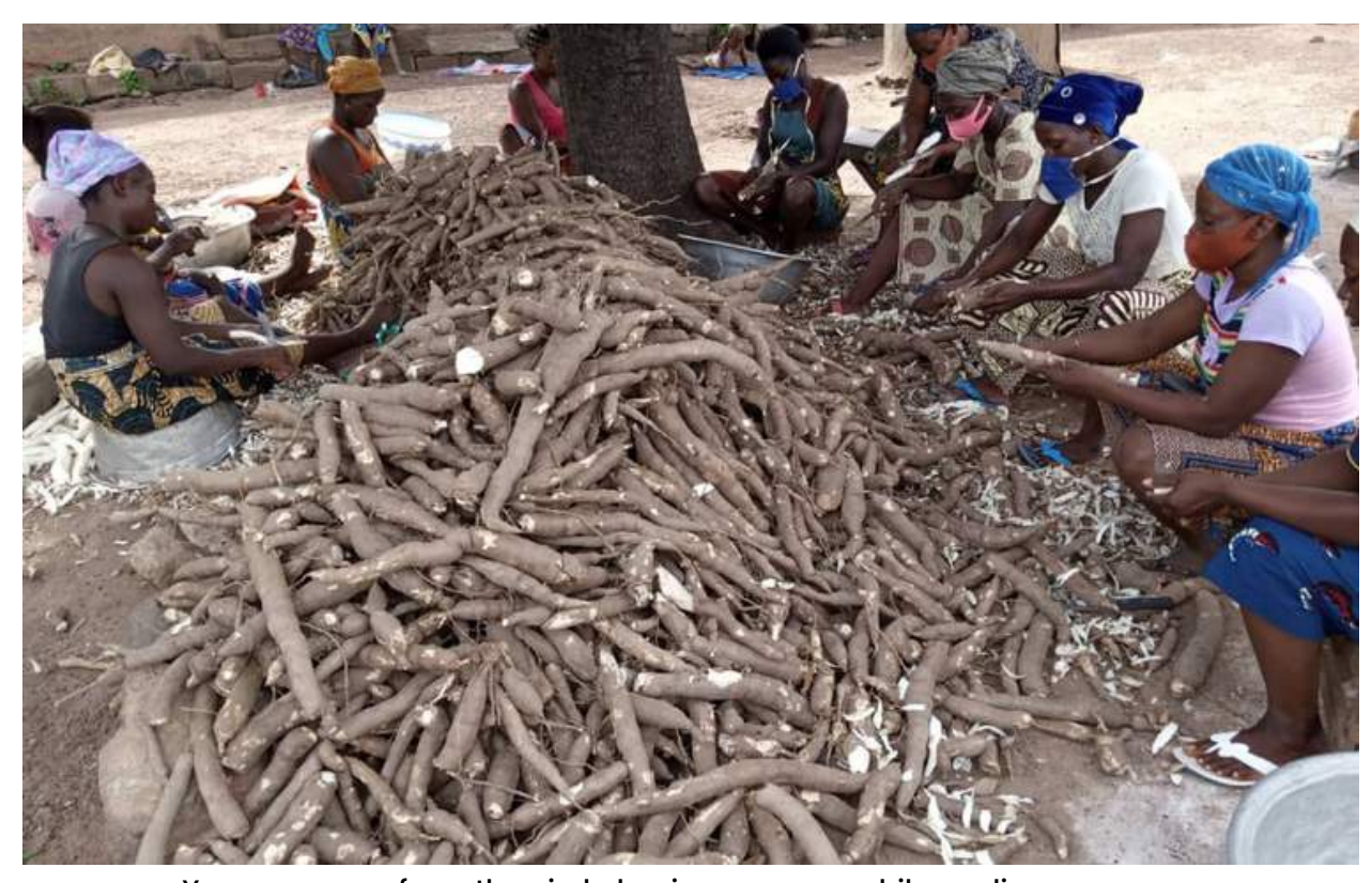
Young women from the circle buying cassava while peeling cassava